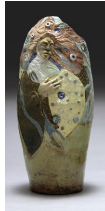
No. 27: Bob Coates, Selene (The Moon) , ceramic, 20 x 12 x 12 in., Opening Bid: $210.00