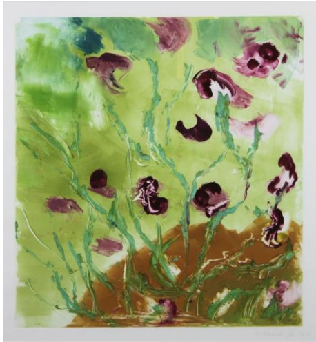
Lot No. 57: Katherine Kadish, Untitled , monotype, 40 x 30 in., Opening Bid: $800.00