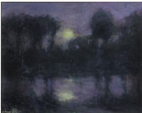
Lot No. 68: Evelyn Mahrt, Evening , oil, 18 x 21 in., Opening Bid: $300.00