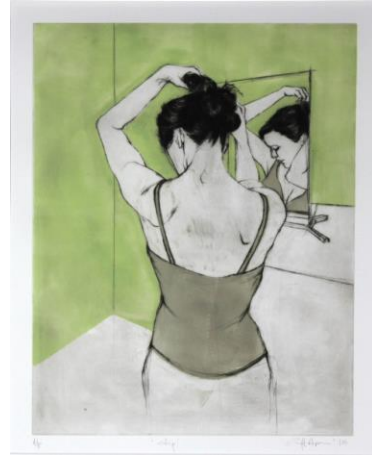
Lot No. 50: Erin Holscher Almazan, Slip , from series Interiors , drypoint and monoprint, 21 x 18 in., Opening Bid: $250.00