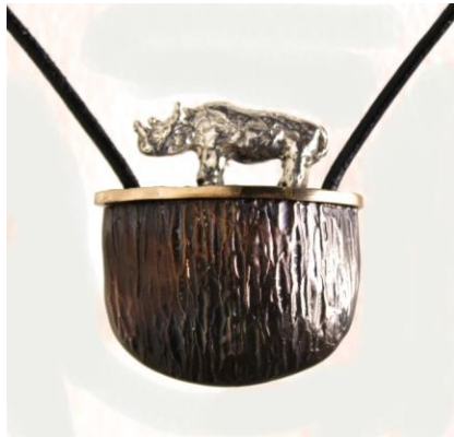
Lot No. 15: David Brand, Don't Let Them Go Extinct , jewelry, 2 in. dia., Opening Bid: $125.00