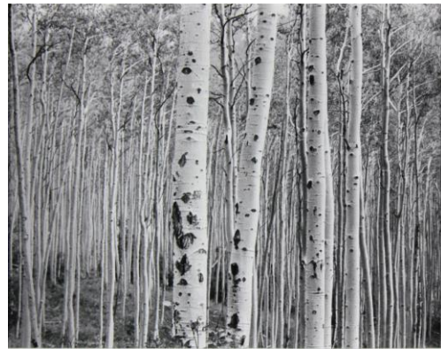
Lot No. 73: Margie McCullough, Aspen Trees I , gelatin silver print, 16 x 20 in., Opening Bid: $150.00