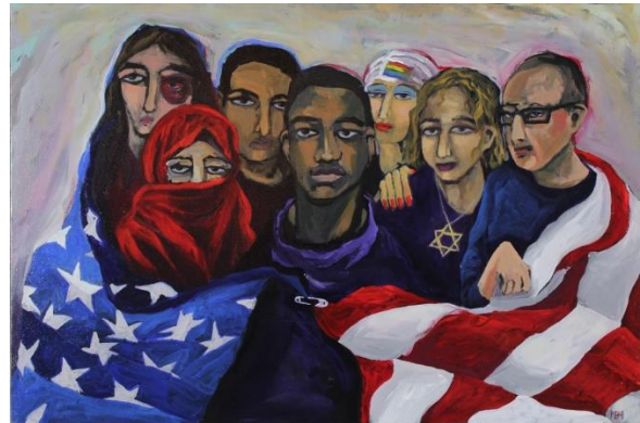
Lot No. 51: MB Hopkins, Huddled Masses , acrylic, 24 x 36 in., Opening Bid: $700.00