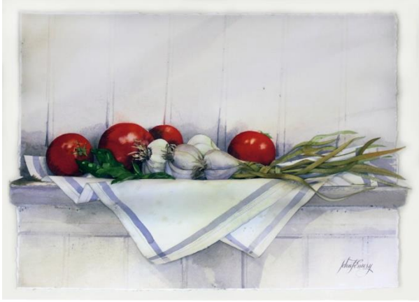
Lot No. 36: John Emery, Summer Trinity , 18 x 22 in, Opening Bid: $900.00