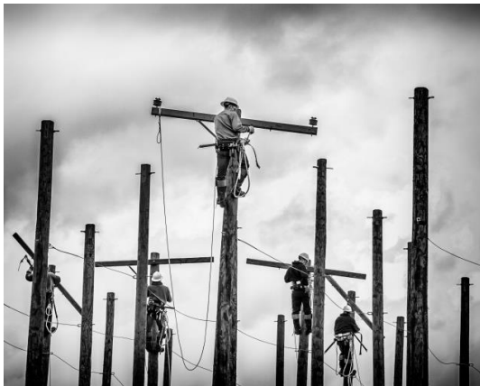
Lot No. 39: Bill Franz, The Linemen , archival pigment print, 24 x 30 in., Opening Bid: $350.00