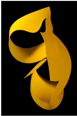
Frances Smith (WSU), Study in Yellow #1 , 2018, archival inkjet print, courtesy of the artist