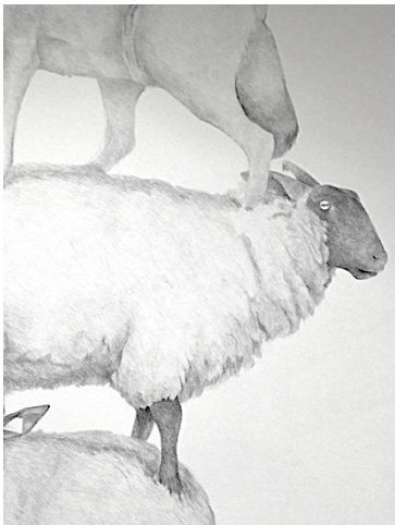
Andrew Dailey, Counting Sheep (detail), 2019, graphite